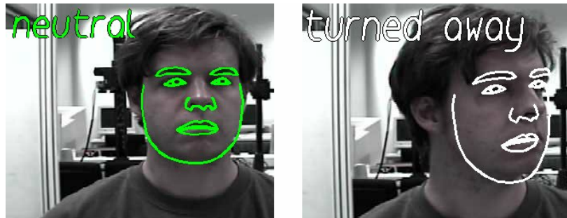
Fig. 2. Detected customer mimics “neutral” and “turned away”

value for similar issues that could make use of the head's pose and deformation. Other approaches additionally incorporate the facial texture and 3D information, which improves the tracking quality but loses real time capability.